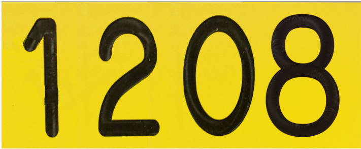
One-Piece Sequential Plate